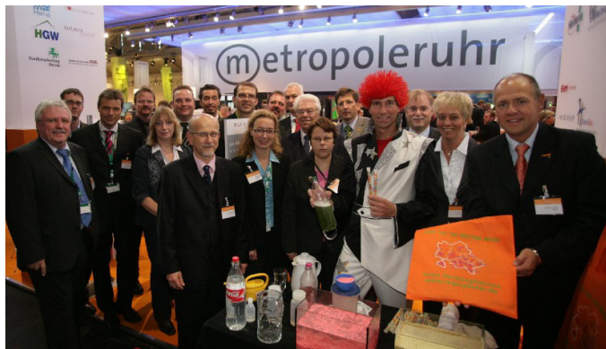
The Ruhr metropolis team in the exhibition hall of the Expo Real in Munich.

“Hier können Sie anlagen” was the motto with which the Ruhr Area introduced its new real estate projects on the water. With titles like “Urbane Wasserlagen” or “Fluss Stadt Land”, over 30 individual projects with a variety of uses for residence, service or commerce with a total investment of around 3 billion euros were presented on over 1,000 hectares. An estimated 28,000 jobs are expected to result from these water projects. Water will also be the topic of the “Expedition through the Ruhr knowledge metropolis”. In September the Regionalverband Ruhr (Ruhr Regional Association), in cooperation with the cities of Dortmund, Bochum, Duisburg and Essen, will present a three-week event on the topic of water. The goal is to bring science, industry and the public closer together through cultural and scholarly activities.